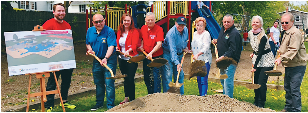
Local, county and elected leaders joined together Sunday for a groundbreaking ceremony at the site of the soon-to-be-built inclusive playground at Marilyn Toohey Park in Lewiston.